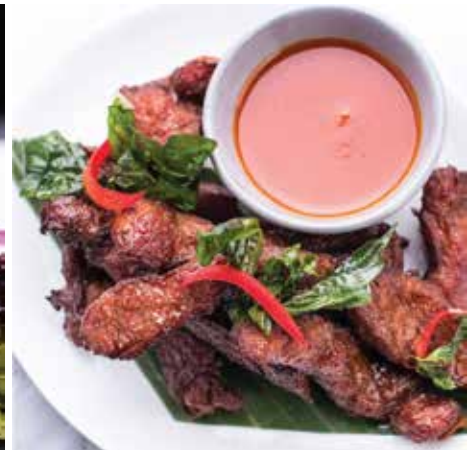
DEEP-FRIED PORK STRIPS (MOO DADE DEAW)

Fried spring rolls stuffed with succulent prawns, cilantro and sweet taro, served with Noi style plum sauce. 13.95