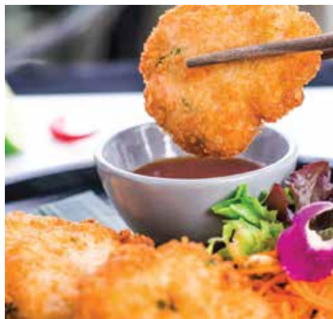
THAI SHRIMP CAKES (TOD MUN GOONG)

Fried spring rolls stuffed with succulent vegetables, served with our secret plum sauce. 12.95