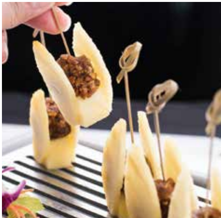
SWEET THAI MINCED CHICKEN RELISH (MAR HOR) (GF)

A traditional Thai appetizer featuring ground chicken with palm sugar, peanuts and shallots served with skewered pineapple. This dish incorporates two distinctive tastes in one luscious bite. 15.95