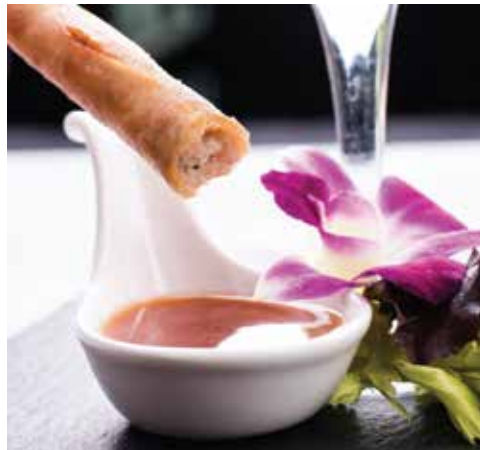
CRISPY TARO ROLLS

A traditional Thai appetizer featuring ground chicken with palm sugar, peanuts and shallots served with skewered pineapple. This dish incorporates two distinctive tastes in one luscious bite. 15.95