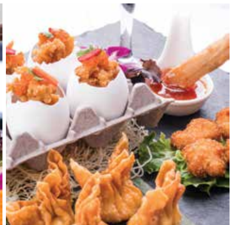
■ APPETIZER SAMPLER

Amazing fried shrimp cakes, served with Noi style plum sauce. 15.95