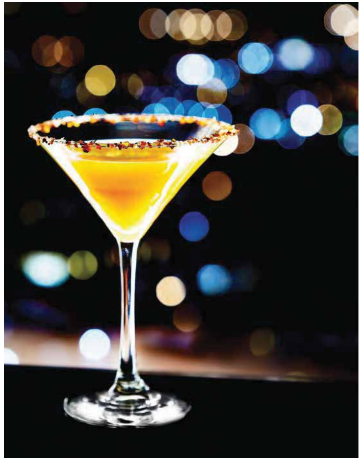
DIAMOND HEAD MANGO DROP

"It's never too early for a cocktail." © Noel Coward